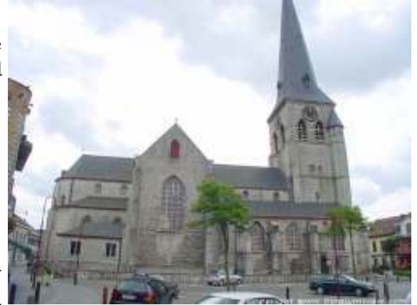
The centre of Londerzeel and our church

This is a must if you come to Londerzeel!