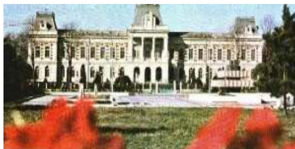
The Prefect's Palace - was built between 1895-1898

With 1731 Călărași had been a market town;