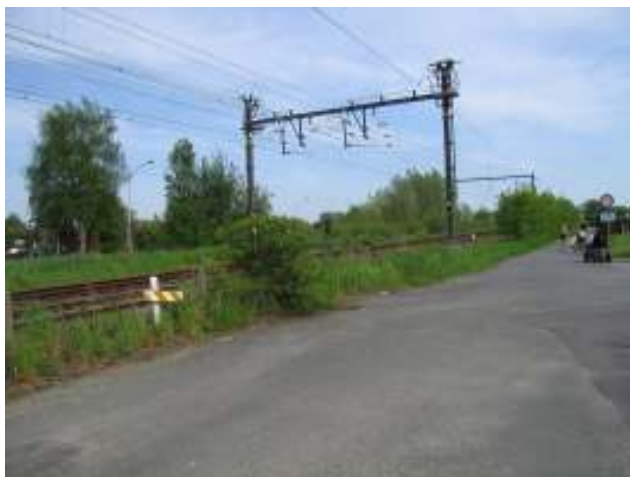
Train way to the centre of Londerzeel

We are the proud owners of a big sports hall that has a swimming pool and a fitness centre.